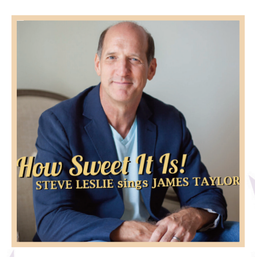
Friday January 9, 2026 7:00 p.m.